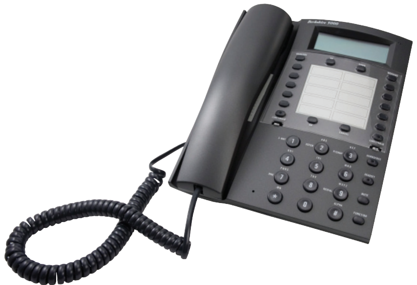
Available with PoE